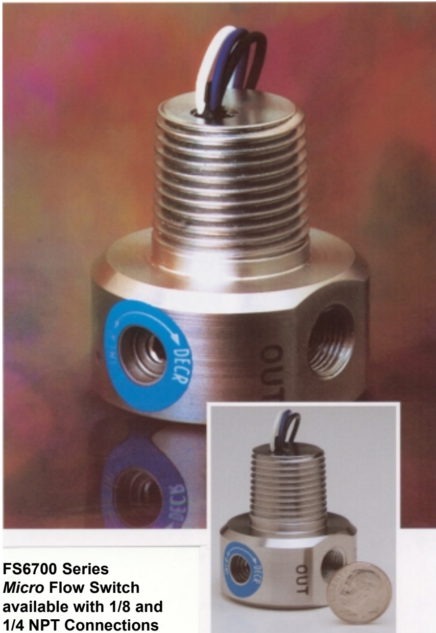
FS6700 Series Micro Flow Switch available with 1/8 and 1/4 NPT Connections

Adjustable Liquid Series - Range 0.5 ml/min to 800 ml/min